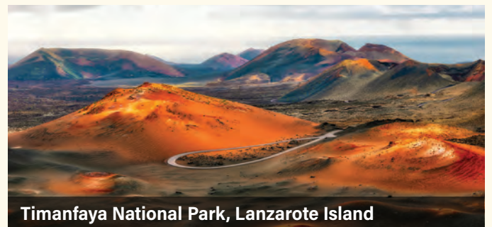
Timanfaya National Park, Lanzarote Island