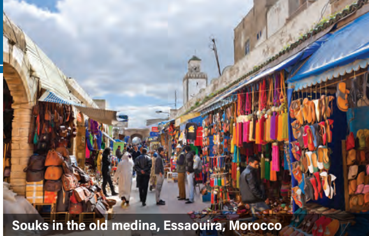
Souks in the old medina, Essaouira, Morocco

the Grand Mosque and spend some time browsing the nearby souks, where vendors hawk everything from dried dates and colorful fabrics to spare car parts. (B,L,D)