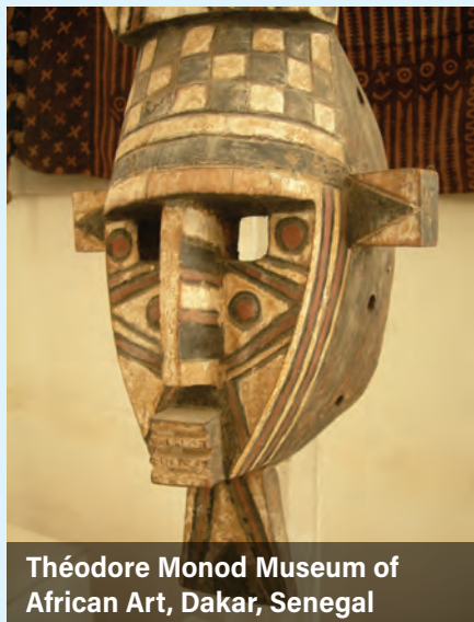
Théodore Monod Museum of African Art, Dakar, Senegal

NOT INCLUDED: International airfare; travel insurance; expenses of a personal nature; any items not mentioned in the itinerary or the above inclusions.