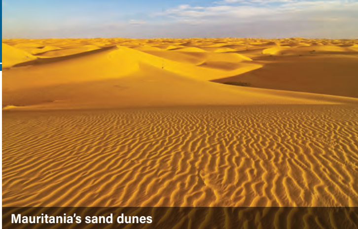
Mauritania's sand dunes