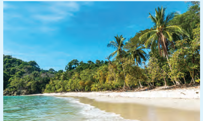
Tropical beach in Manuel Antonio National Park, Costa Rica