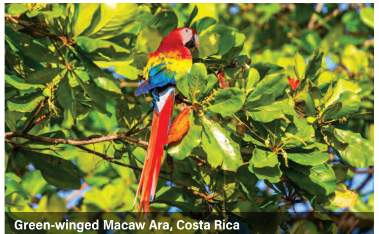
Green-winged Macaw Ara, Costa Rica