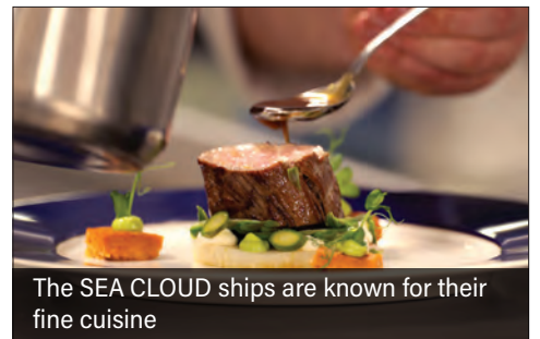
The SEA CLOUD ships are known for their fine cuisine

Built in 2021, the SEA CLOUD SPIRIT is undoubtedly among the world's most unique and beautiful cruise ships. Measuring 452 feet in overall length, and with a beam of 56 feet, SEA CLOUD SPIRIT is an authentic three-mast full-rigged yacht that combines the traditional aspects of ocean-going sailing ships of bygone eras with 21st-century state-of-the-art technologies and amenities. One of the most thrilling experiences aboard is to watch the skilled crew hoist by hand the ship's 28 sails, which cover a total sail area of 44,100 sq ft. When not riding the winds, the ship is powered by diesel-electric engines with low-sulfur marine diesel oil. The combination of traveling under sail and high-quality diesel oil for the engines provides one of the most sustainable cruising experiences available.