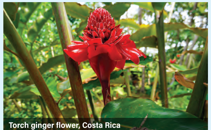
Torch ginger flower, Costa Rica