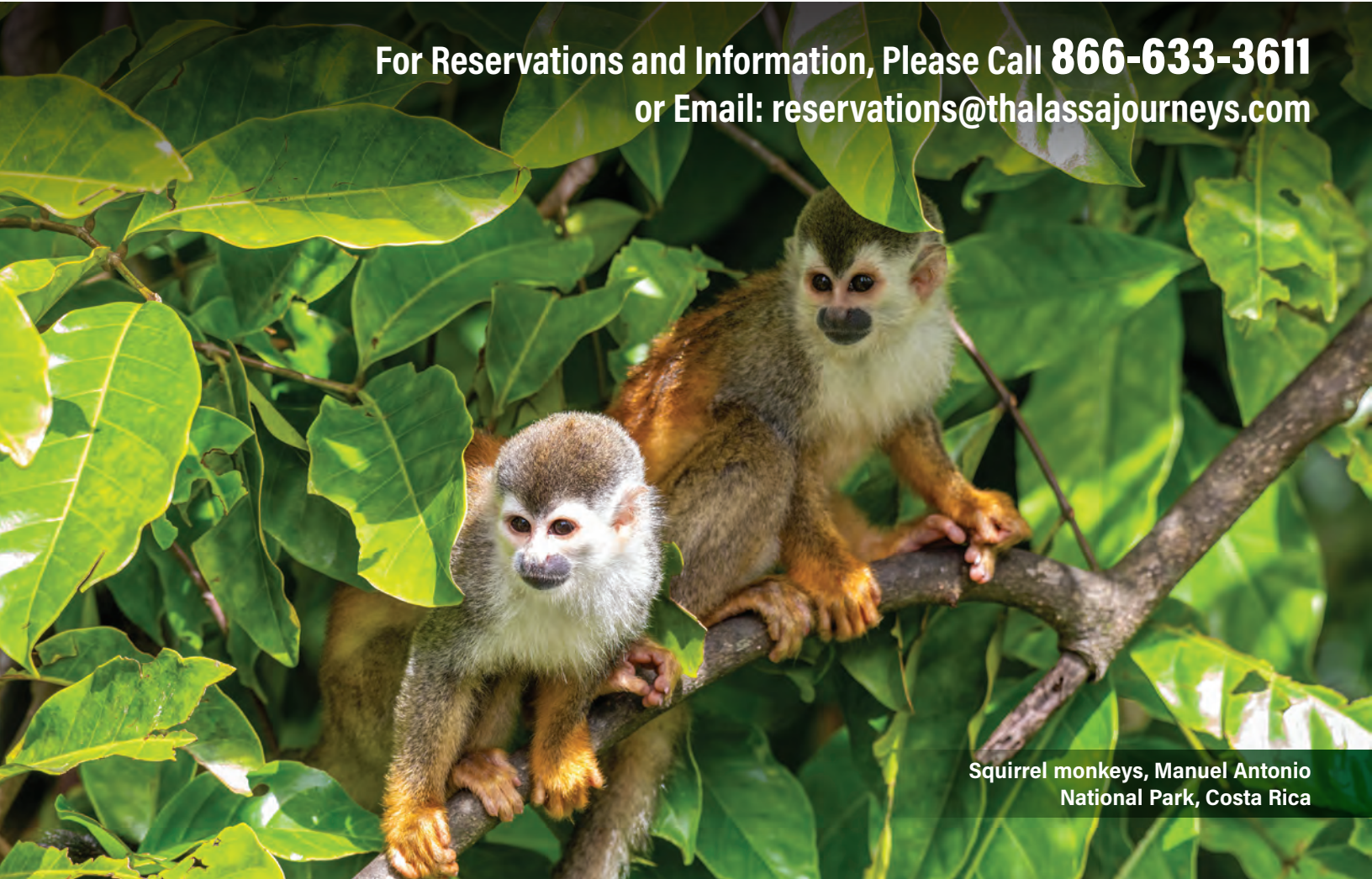
Squirrel monkeys, Manuel Antonio National Park, Costa Rica

For Reservations and Information, Please Call 866-633-3611 or Email: reservations@thalassajourneys.com