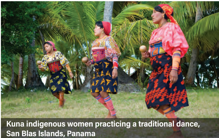
Kuna indigenous women practicing a traditional dance, San Blas Islands, Panama

During this day at sea, watch the skilled crew climb the rigging, set