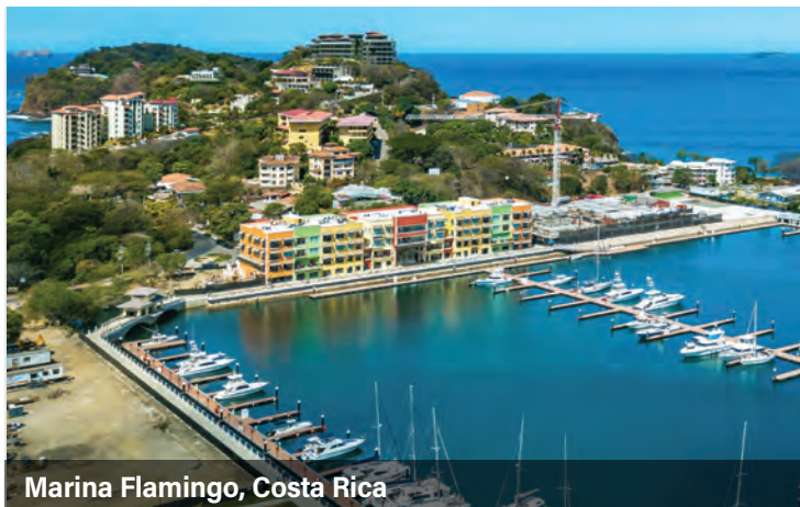
Marina Flamingo, Costa Rica

After breakfast, disembark in Colón, the eastern terminus of the Panama Canal. Transfer to the international airport in Panamá City for flights homeward. (B)