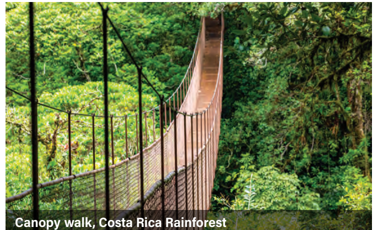
Canopy walk, Costa Rica Rainforest