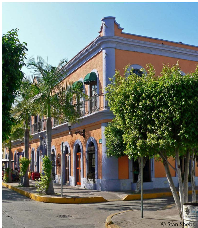
Plaza Machado, Mazatlán

COVER: Solar eclipse, (bottom from left) public art in Mazatlán; La Reina de los Mares (Queen of the Seas) bronze, one of many mermaid statues found in Mazatlán; "Houses of Colors" on Ángel Flores Street in the Historic Center of Mazatlán