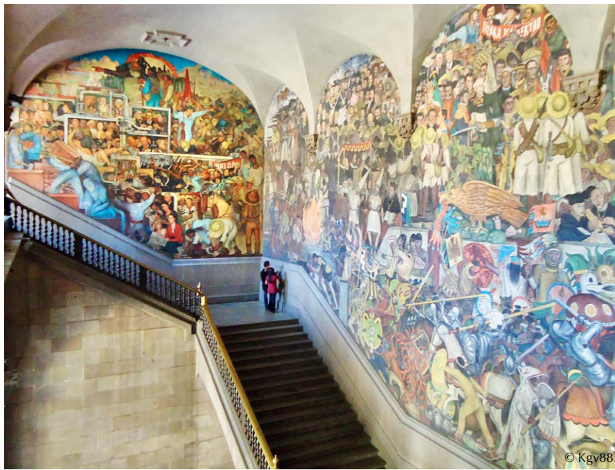
Diego Rivera's "History of Mexico" mural at the National Palace, Mexico City

activities before the big event. First contact will take place at 12:00pm local time, and then it all happens one hour and 17 minutes later at 1:17pm. The totality will last just over four minutes. After the eclipse, we will celebrate with a special lunch before joining the festivities that will be scheduled all afternoon in town. Dinner is on your own this evening. (B,L)