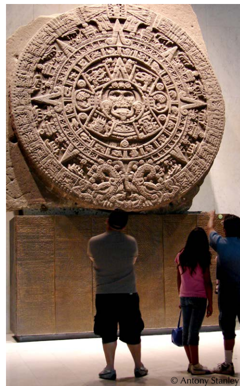
Aztec Stone of the Sun at the National Museum of Anthropology in Mexico City

Today is the day! After an eclipse briefing, enjoy some fun celestial games and preparatory