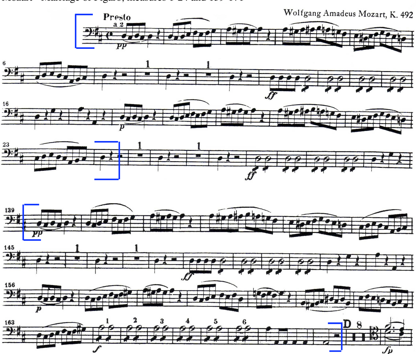
Mozart - Marriage of Figaro, measures 1-24 and 139-171