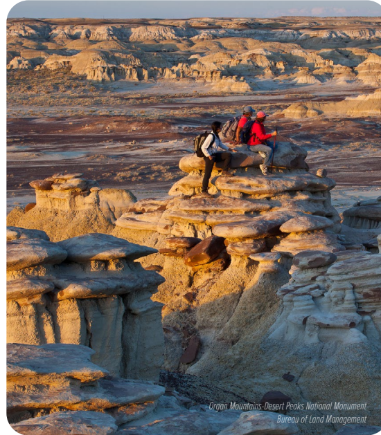
Organ Mountains-Desert Peaks National Monument Bureau of Land Management