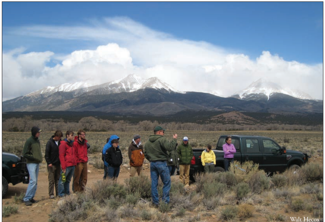
A Colorado College environmental synthesis field trip, 2011.