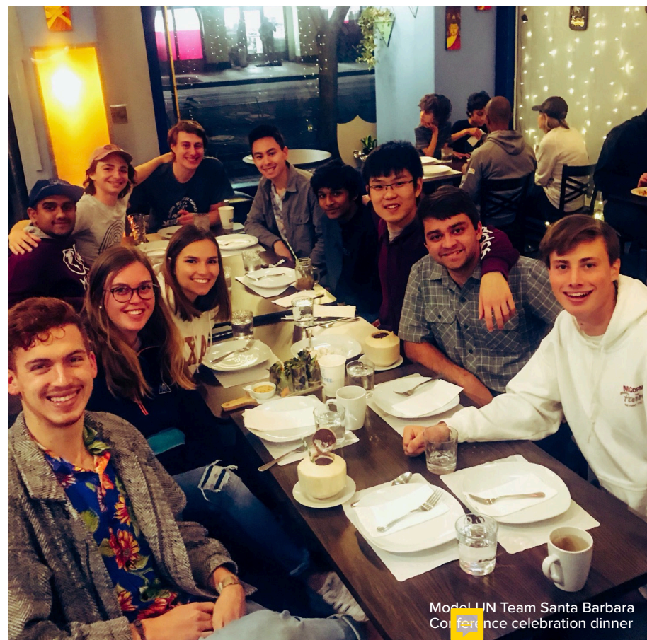
Model UN Team Santa Barbara Conference celebration dinner