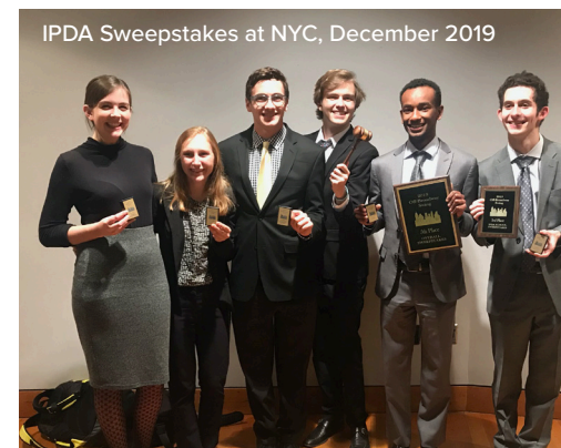
IPDA Sweepstakes at NYC, December 2019