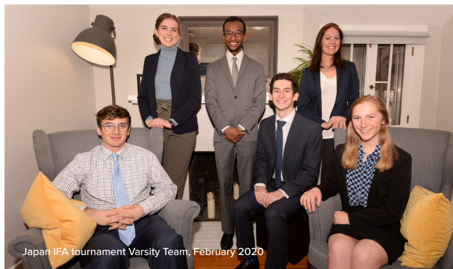
Japan IFA tournament Varsity Team, February 2020