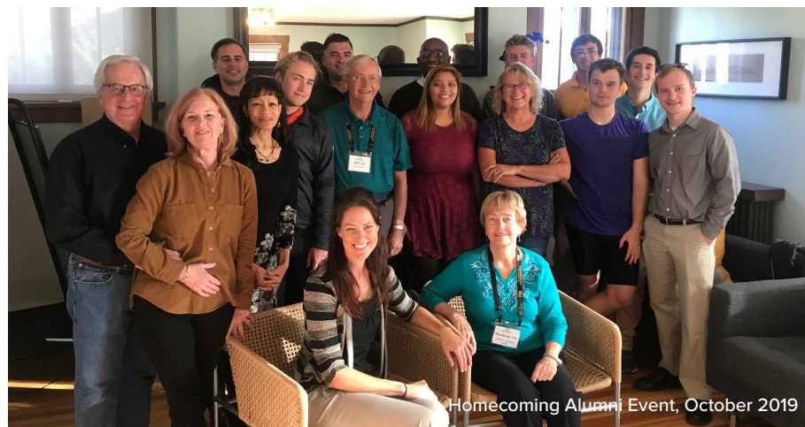
Homecoming Alumni Event, October 2019

As we anticipate increased team membership, continued successful competition and advancement, including a place on the international stage, and our new Competitive Communications House, Colorado College is grateful to our generous supporters, whose donations provide necessary support as our students engage, learn, and grow.