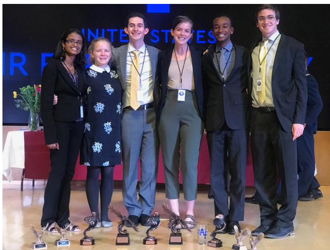
Speech and Debate USAFA, September 2019

In addition to tournament travel, we were pleased to have several alumni return for the annual James 'Al' Johnson Memorial Tournament to judge rounds and assist in logistics throughout the weekend. We are so appreciative of their support, and students enjoyed the reunion and new friendships formed with our alumni, in addition to competition.