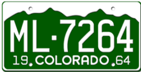
License Plate Image: