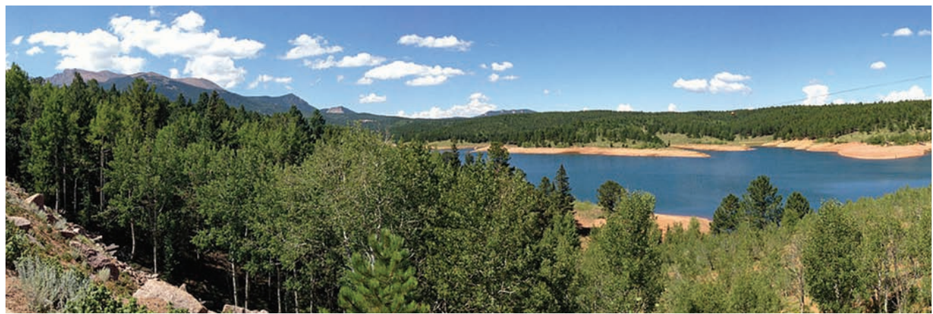
"Crystal Creek Reservoir 1" by Fredlyfish4 - own work, Licensed under Creative Commons Attribution-Share Alike 3.0 via Wikimedia Commons -