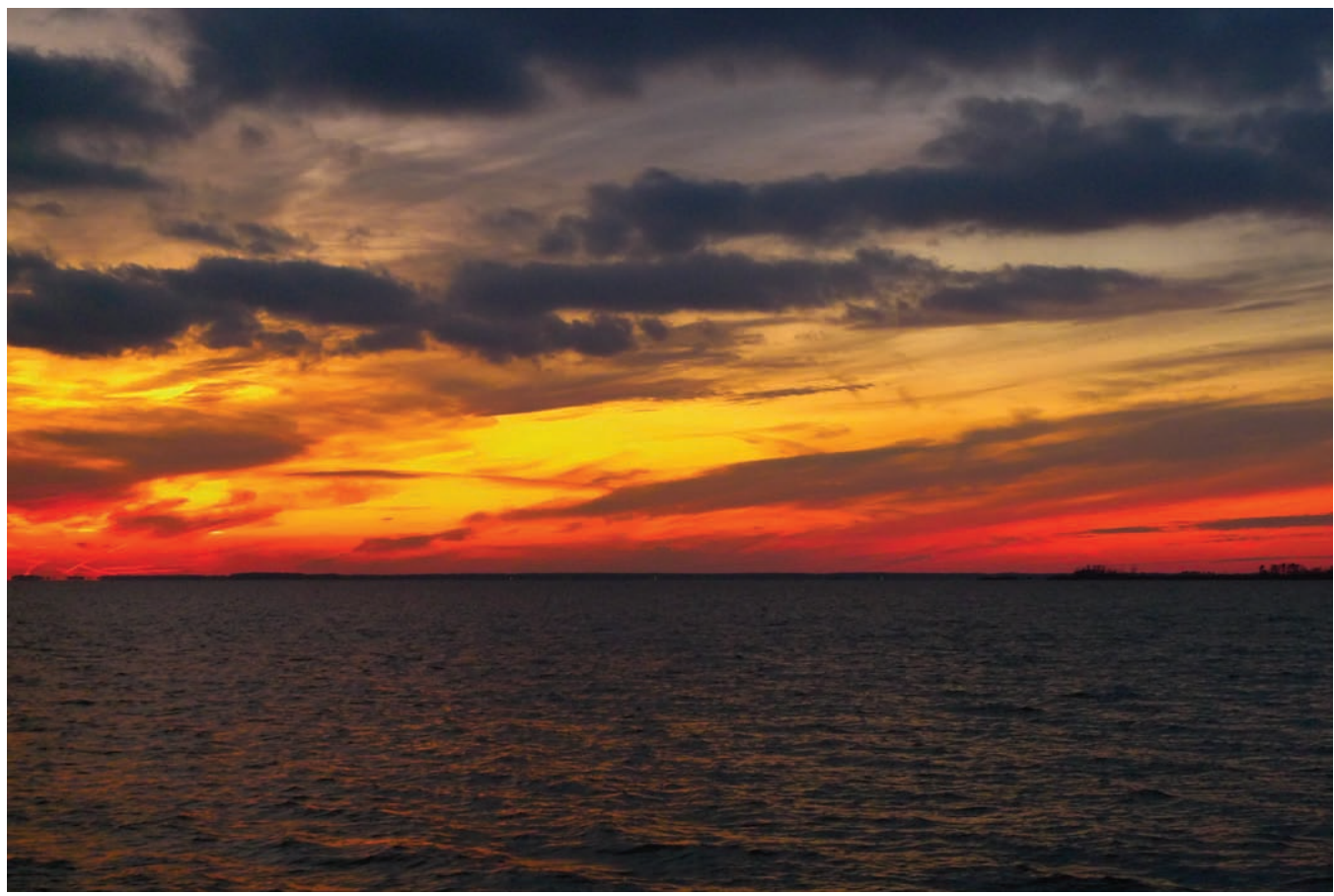
"Sunset – Eastern Bay 7" by Nora Lives – (own work). Licensed under Creative Commons Attribution-Share Alike 3.0 via Wikimedia Commons – http://commons.wikimedia.org/wiki/File:Sunset __Eastern_Bay_7.jpg#mediaviewer/File:Sunset __Eastern_Bay_7.jpg