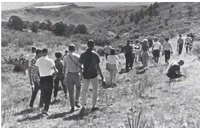
Colorado College, A 1969 Geology and Ecology of Pikes Peak Field Trip