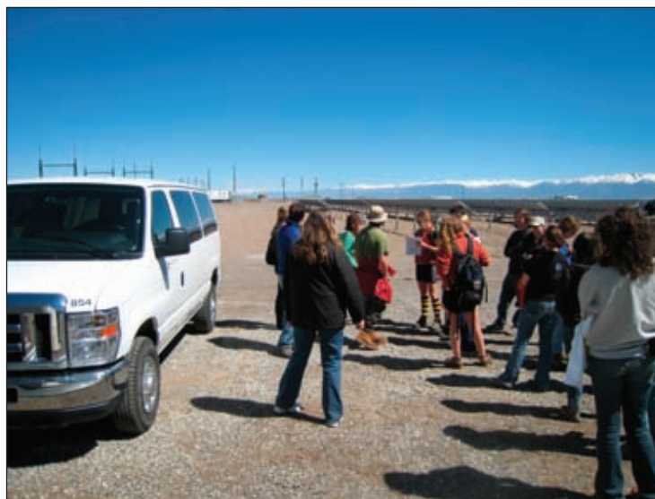
© Walt Hecox, Field Trip in San Luis Valley, CO