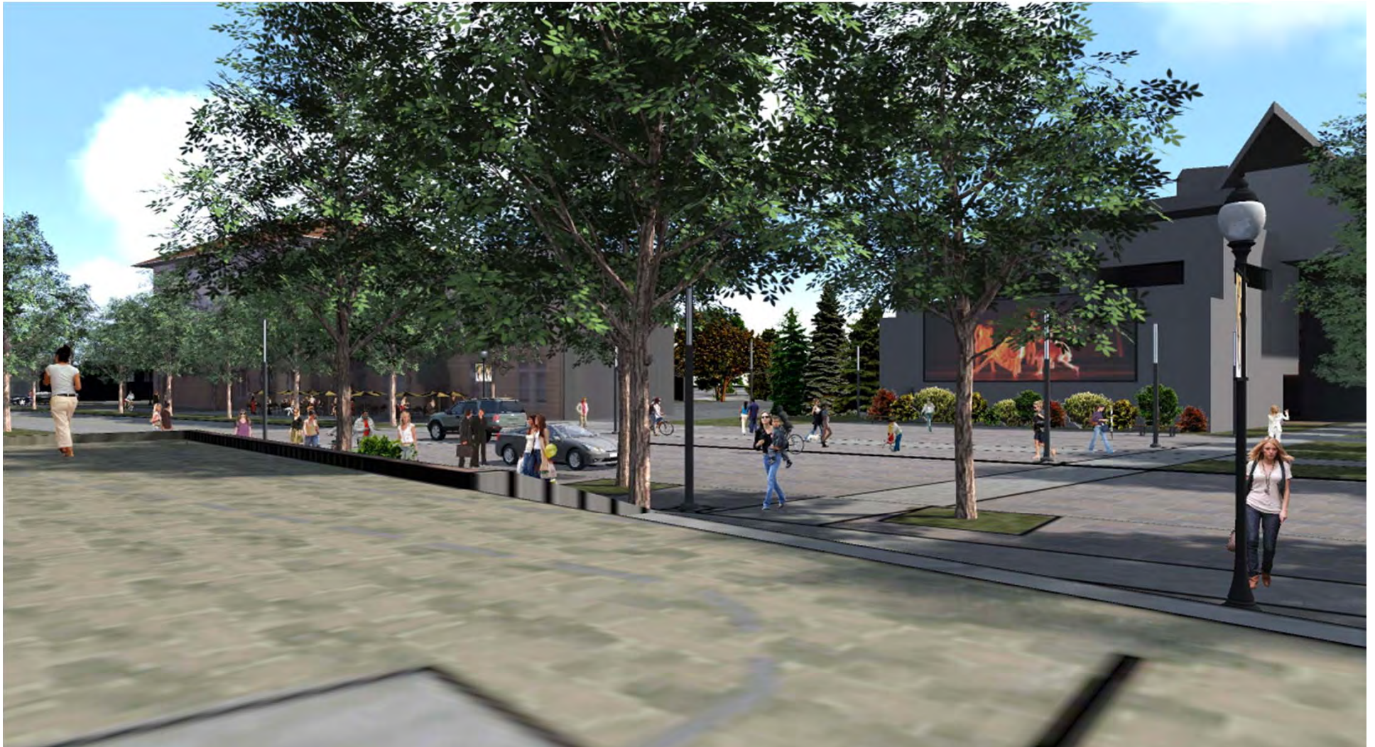
PROPOSED VIEW FROM ARMSTRONG TERRACE