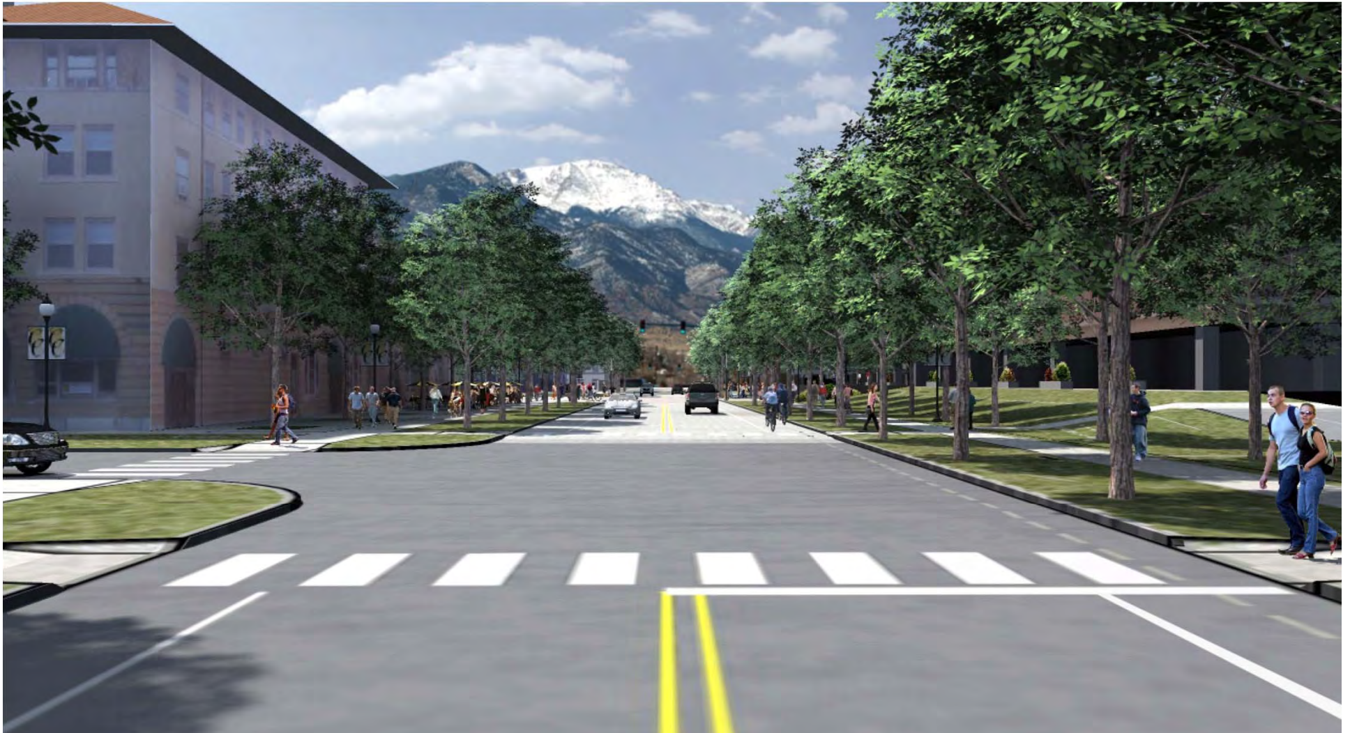
PROPOSED VIEW AT TEJON STREET