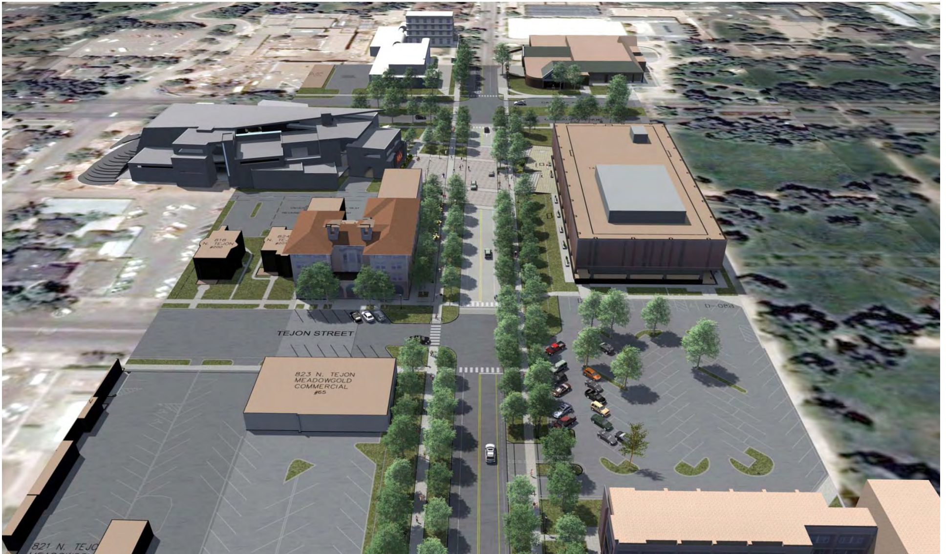
PROPOSED VIEW – AERIAL LOOKING WEST