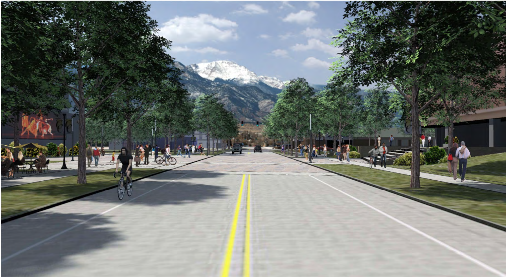
PROPOSED VIEW APPROACHING CORNERSTONE