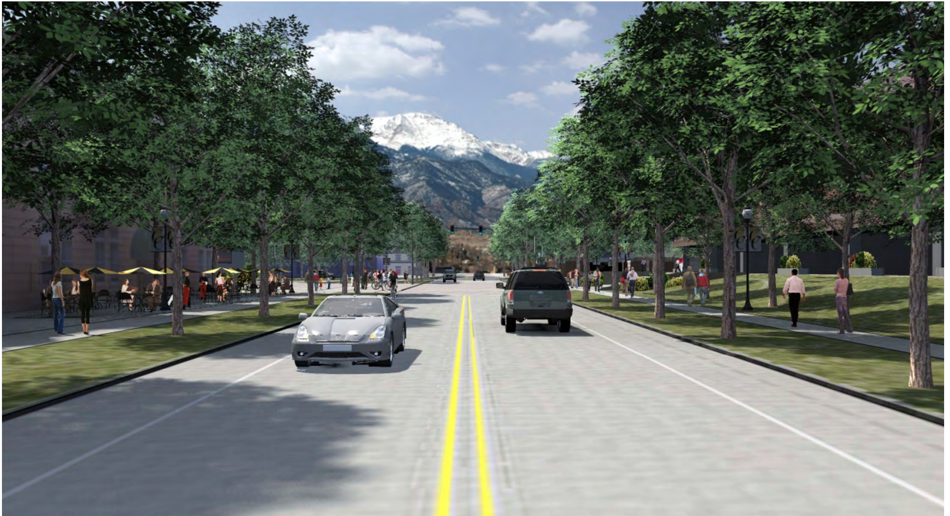
PROPOSED VIEW AT SPENCER CENTER