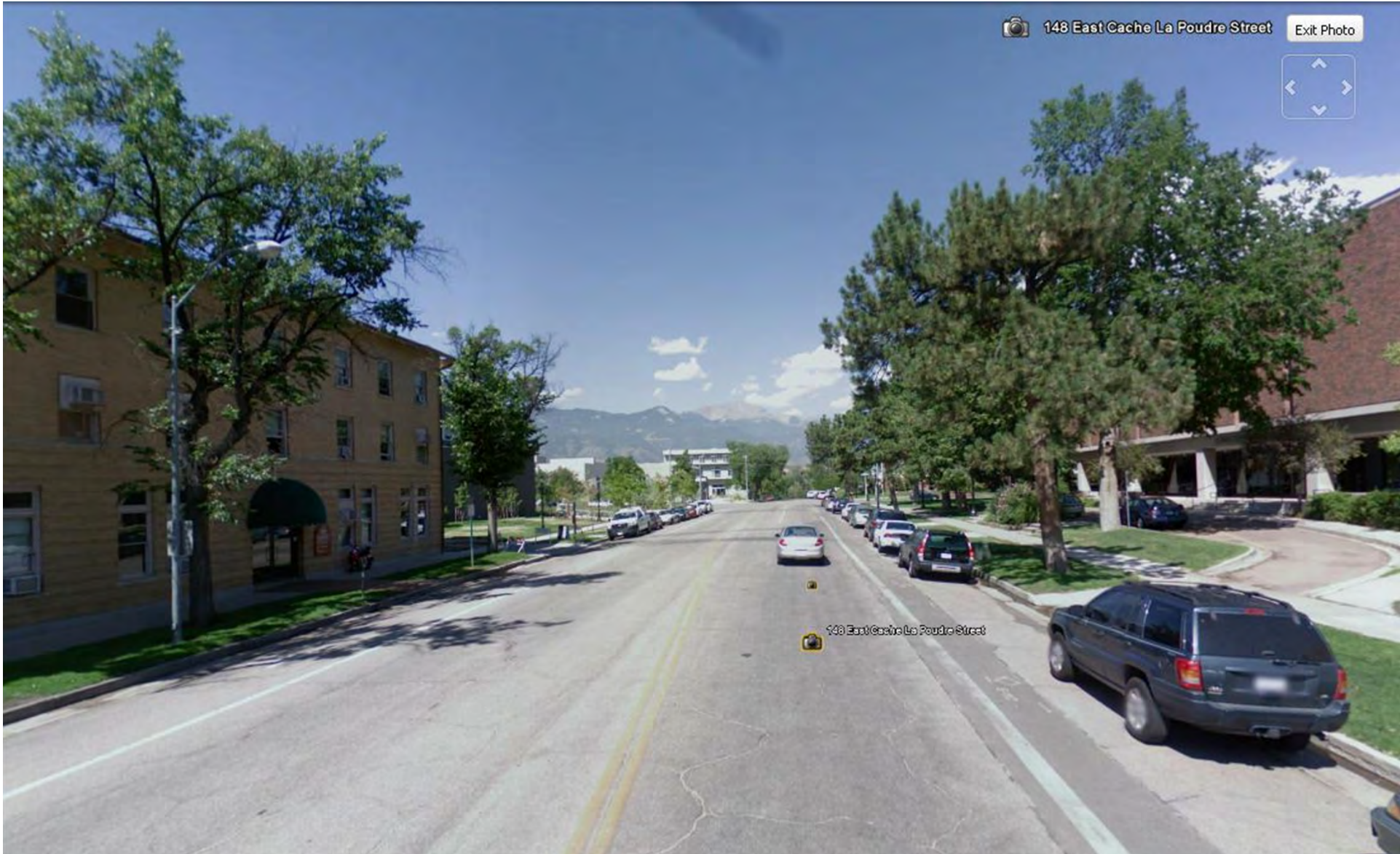
EXISTING VIEW AT SPENCER CENTER