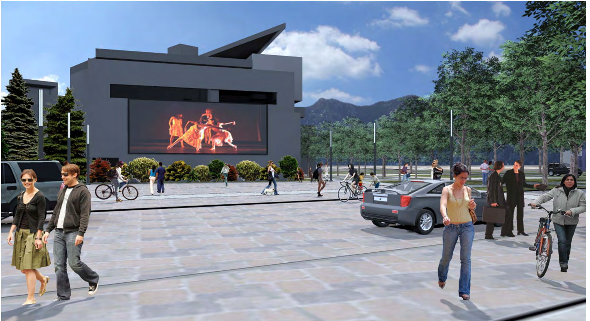
PROPOSED VIEW TOWARD CORNERSTONE