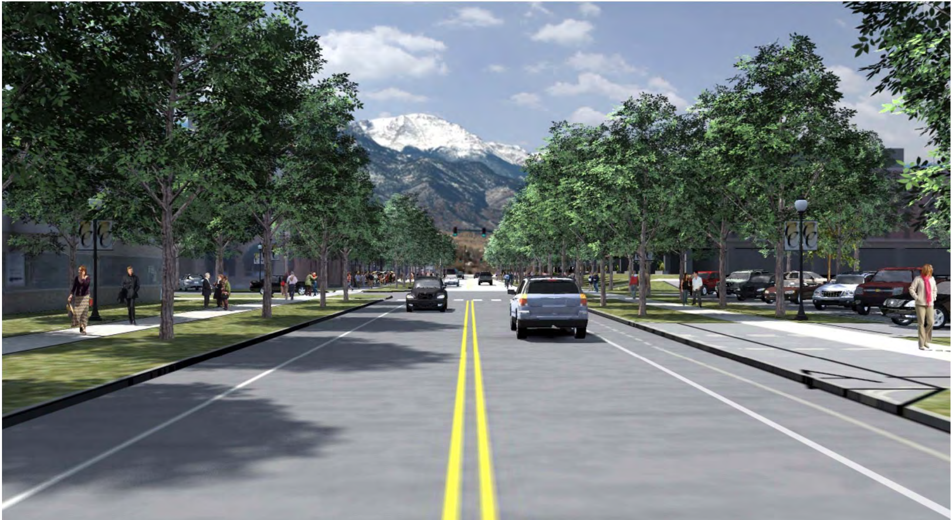
PROPOSED VIEW APPROACHING TEJON STREET