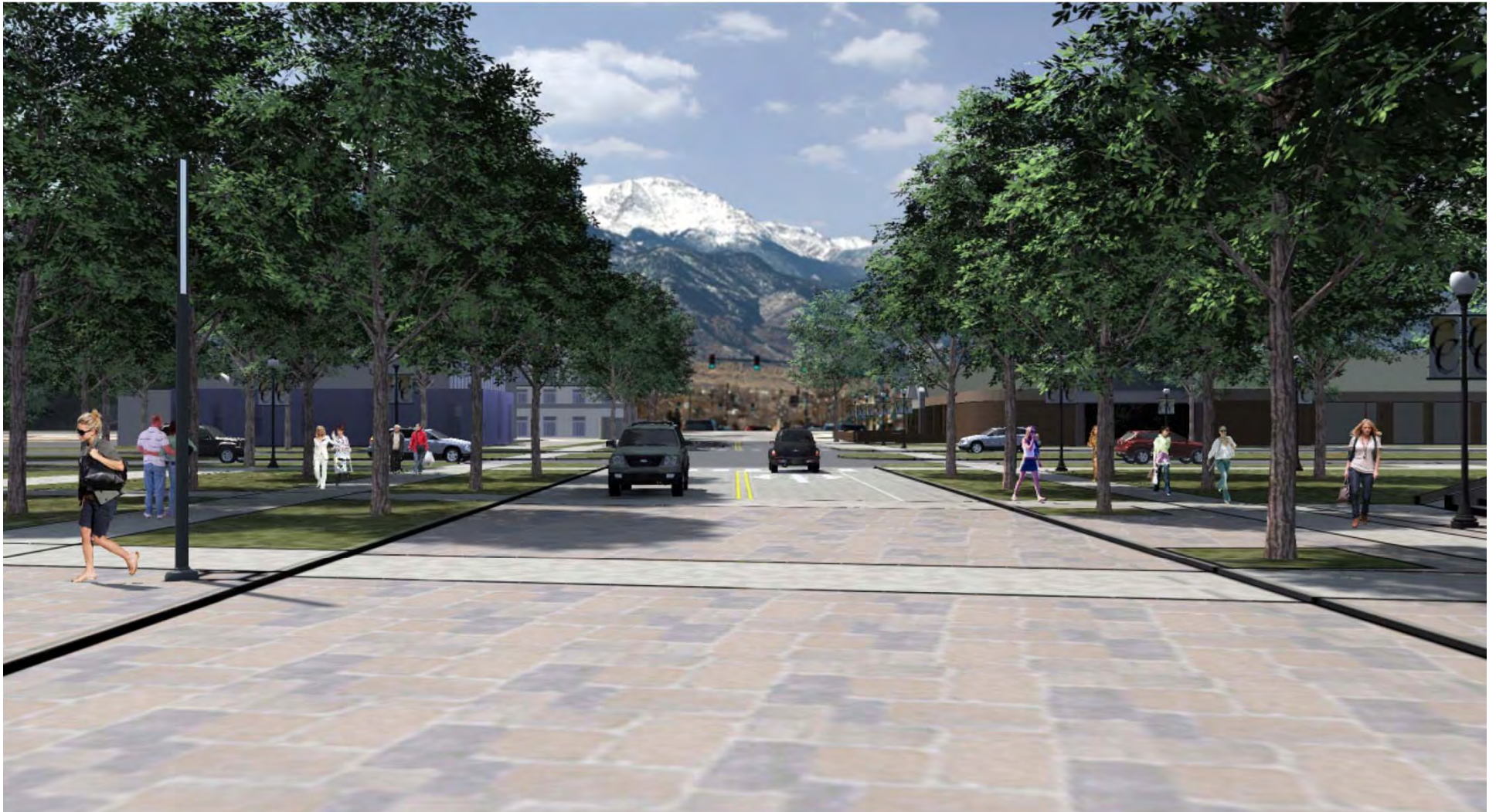
PROPOSED VIEW APPROACHING CASCADE AVENUE