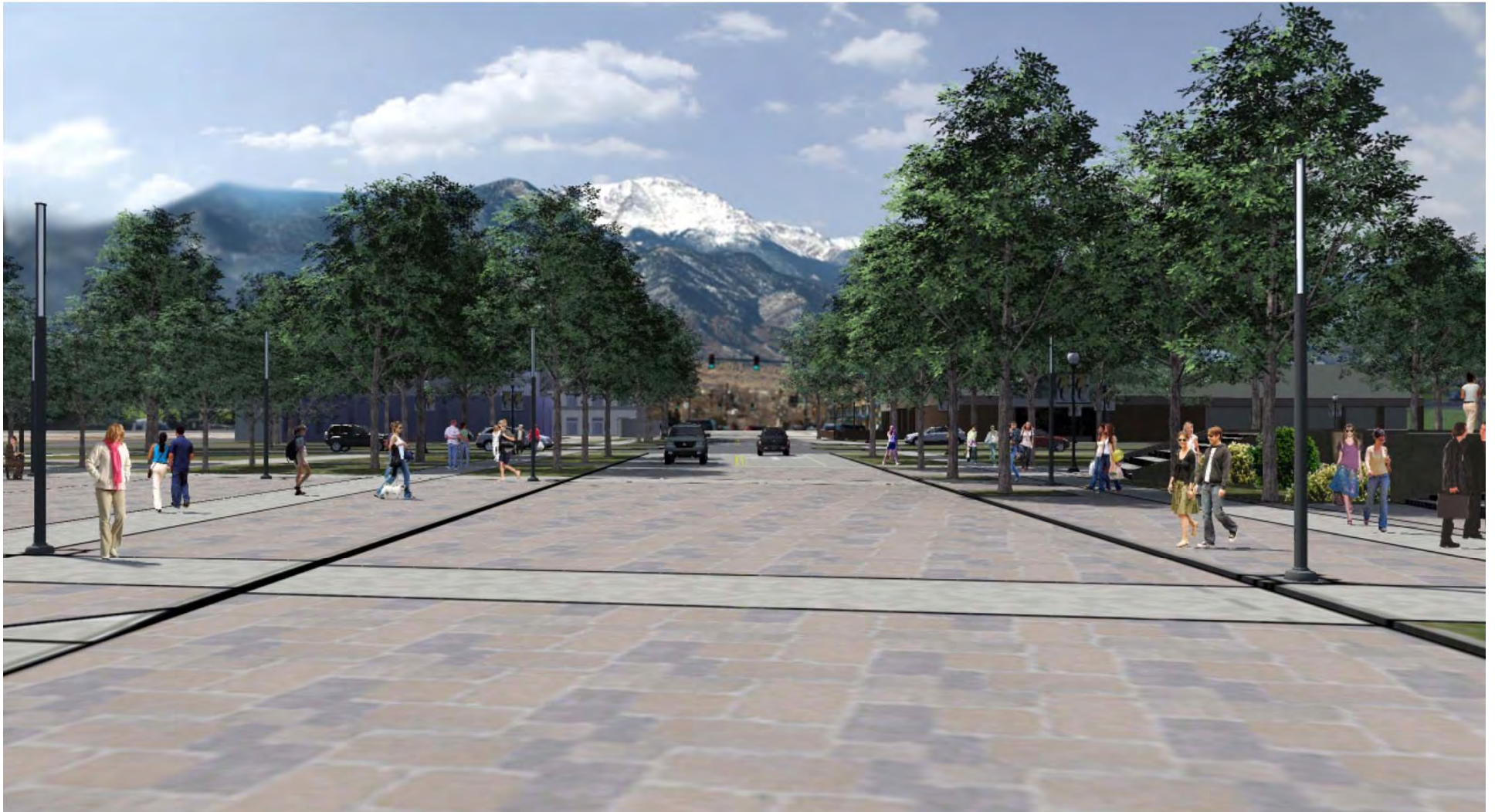
PROPOSED VIEW AT ARMSTRONG ENTRY