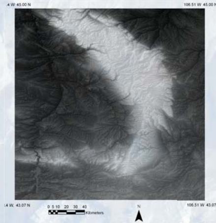
FIGURE 2. Shaded relief digital elevation model of the Bighorn Mountains, Wyoming. The white area corresponds to the elevated terrain that approximately corresponds to the crest of the elongate NW-SE-orientated structural arch.