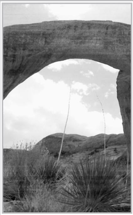
WES Canyons Trip, Fall 2009