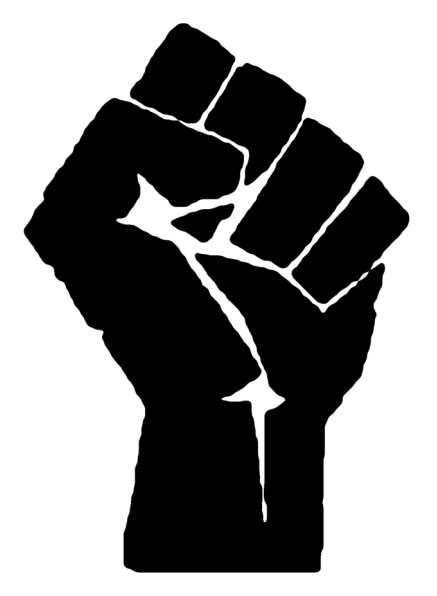
FRIDAY, OCTOBER 27th 12:45pm in PALMER 225

If you want to help in their fight against mass incarceration, attend this meeting to learn about what you can do! This meeting is Block 3's only all-group, general meeting where they will revise their organization's mission statement and structure, and develop a leadership team. You must attend if you want to consider leadership. Subsequent meetings will be specific to different initiatives, so get involved now!