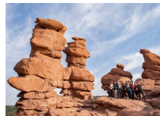
Garden of the Gods

{Student Name} c/o Colorado College Summer Music Festival Department of Music 14 East Cache la Poudre Street Colorado Springs, CO 80903