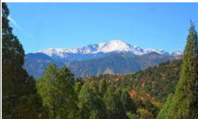
Pikes Peak; 14,111 feet

To prevent or reduce the symptoms of altitude sickness here are a few things to