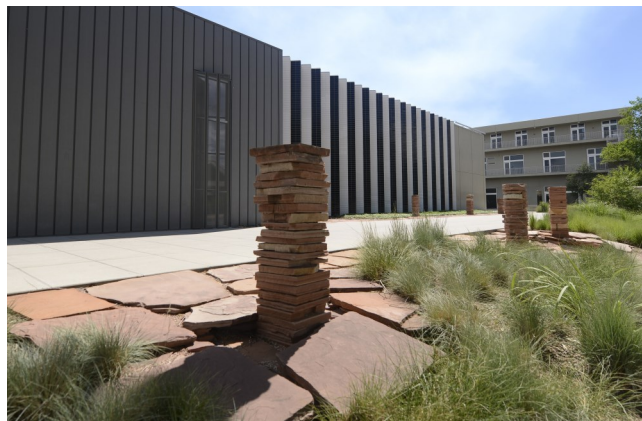
Packard Music Hall

should have dress slacks, black or white shirts or dressy daytime attire. Dress shirts and dresses in color are welcome. Low riding, midriff-baring, tight fitting, and low-cut décolleté fashions are not appropriate for concerts and will not be permitted. No