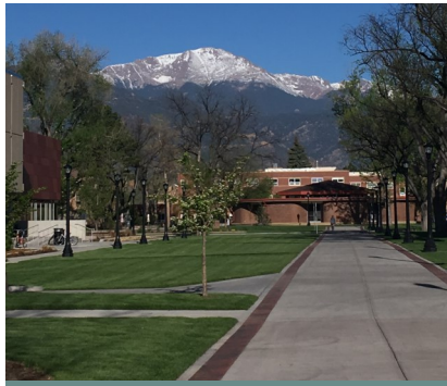
View from CC Campus

We have planned at least two organized trips off campus, including a hike in the Garden of the Gods and Rock Rock Park or the Manitou Incline, depending on interest. Please bring appropriate attire for hiking if you plan to participate in these events (athletic shoes or light hiking boots are suggested; sandals not recommended).