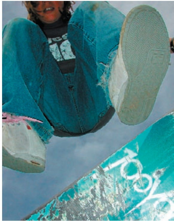
These data come from the Federal Bureau of Investigation's Uniform Crime Index. Some counties did not consistently report crimes to the Uniform Crime Index, potentially affecting the rankings they are assigned.