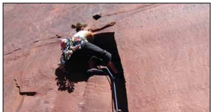
© Liz Kolbe '08, Indian Creek, Utah.