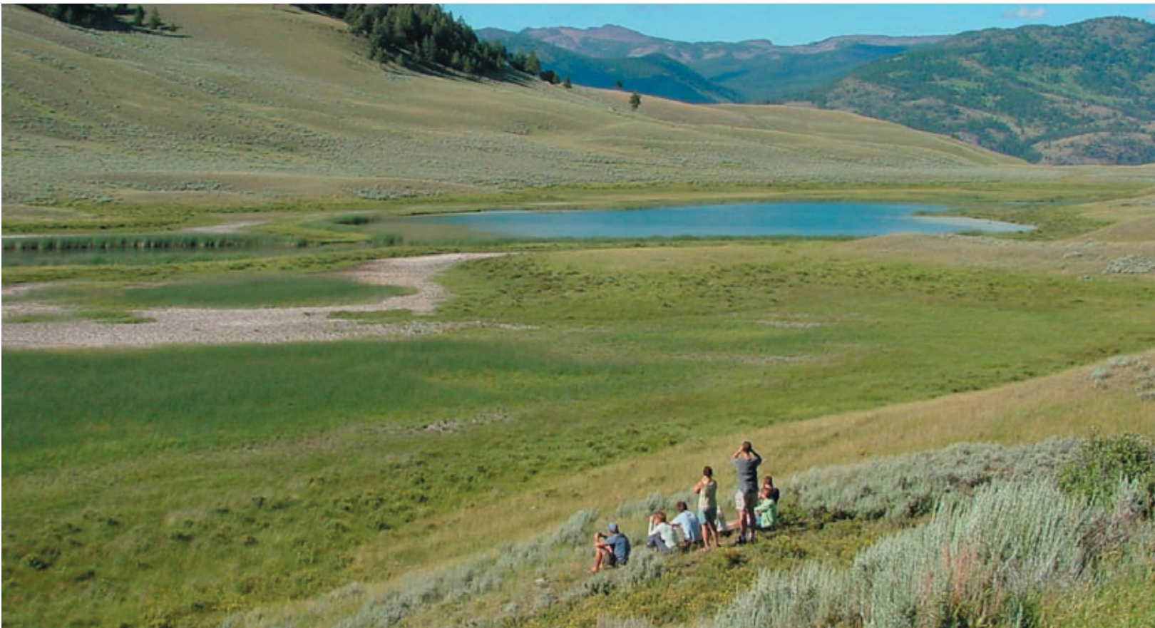
State of the Rockies student research at Great Sand Dunes National Park, Colorado (opposite page), Yellowstone National Park, Wyoming (above), the Hideout Ranch, Wyoming (bottom left), Colorado College, Colorado (bottom middle), and Rocky Mountain Biological Lab in Gothic, Colorado (bottom right).

rugged land. Even then, Tenney saw the college as an ideal place to study anthropology and archeology, use the geology of the region as a natural laboratory, and serve the mining industry by teaching the science of mineralogy and metallurgy. In the early 1900s, a school of engineering was established at CC that offered degrees in electrical, mining, and civil engineering. General Palmer gave the college 13,000 acres of forest land at the top of Ute Pass, upon which a forestry school was built, the fifth forestry school created in the U.S. and the only one with a private forest.