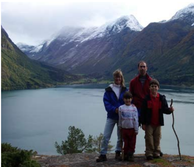
The picture shows my family with the Erdal valley in the background – an added benefit of travel to Norway.