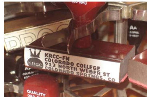
KRCC is ready to mail your EarlyBird card to you today.

KRCC recently won two awards from the Colorado Broadcasters Association for its locally produced news program "Western Skies." The program, which debuted in January 2005, was introduced as a strategic initiative of Colorado College to