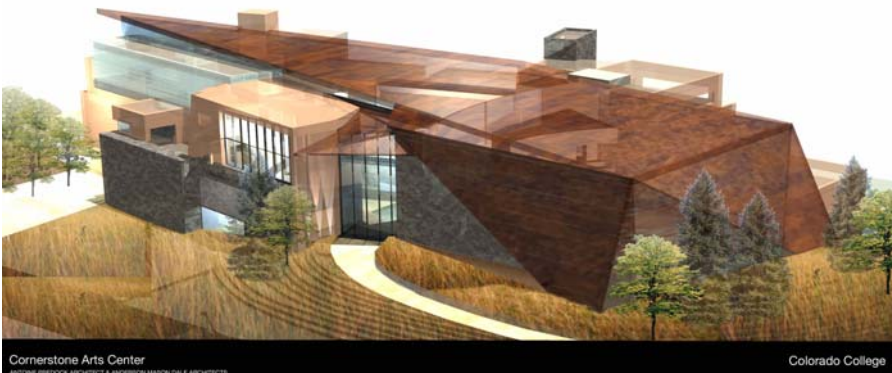
Architect's rendering of the new Cornerstone Arts Center

If you have questions related to construction activity and how it may affect you, please contact the External Relations office and we will be happy to find answers for you.